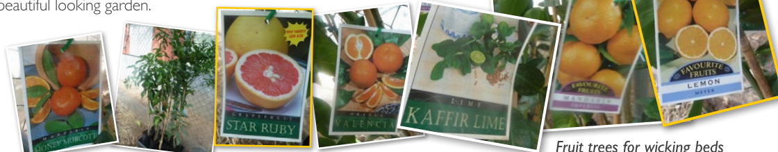
Fruit trees for wicking beds