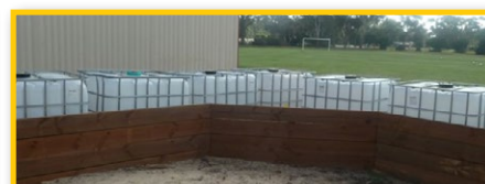
Containers for wicking bed